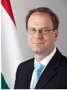
Tibor Navracsics EU Commissioner for Education, Culture, Youth and Sport

Mr Navracsics holds a degree in law and a higher degree as judge. He also received a PhD in political science. He is a lawyer and a politician who served as Minister of Foreign Affairs and Trade from June to September 2014. Between 2010 and 2014, he served as Minister of Administration and Justice. He is a member of the Fidesz party and currently the European Commissioner for Education, Culture, Youth and Sport. Navracsics's field of research are comparative politics and internal politics in the European Union. Speaking both Serbian and Croatian, he wrote a number of analyses relating to the former Yugoslavia.