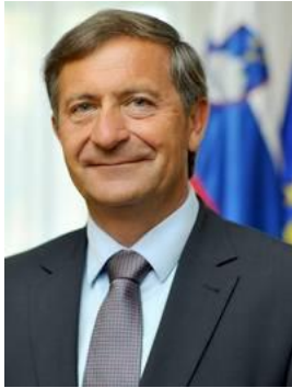
Karl Erjavec Deputy Prime Minister and Minister of Foreign Affairs, Slovenia

Karl Erjavec is the President of the Democratic Party of Pensioners of Slovenia. In 2011, he was Deputy Chair of the National Assembly of the Republic of Slovenia; previously he served as Minister of the Environment and Spatial Planning, Chair of the Informal Meeting of NATO Defence Ministers in Portorož, Slovenia, Minister of Defence, and State Secretary at the Ministry of Justice. He started his career in 1995 as Director of the Expert Service and later Head of the Office of the Human Rights Ombudsman. Mr Erjavec holds a Bachelor's Degree in Law and is the author of a variety of articles on the protection of basic human rights, the functioning of the judicial system and security issues. He regularly lectures at various professional seminars and conferences in Slovenia and abroad.