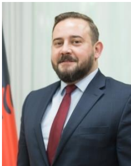
Etjen Xhafaj Deputy Minister for Europe and Foreign Affairs of the Republic of Albania

Mr Navracsics holds a degree in law and a higher degree as judge. He also received a PhD in political science. He is a lawyer and a politician who served as Minister of Foreign Affairs and Trade from June to September 2014. Between 2010 and 2014, he served as Minister of Administration and Justice. He is a member of the Fidesz party and currently the European Commissioner for Education, Culture, Youth and Sport. Navracsics's field of research are comparative politics and internal politics in the European Union. Speaking both Serbian and Croatian, he wrote a number of analyses relating to the former Yugoslavia.