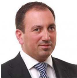
H.E. Igor Crnadak Minister of Foreign Affairs of Bosnia and Herzegovina

Karl Erjavec is the President of the Democratic Party of Pensioners of Slovenia. In 2011, he was Deputy Chair of the National Assembly of the Republic of Slovenia; previously he served as Minister of the Environment and Spatial Planning, Chair of the Informal Meeting of NATO Defence Ministers in Portorož, Slovenia, Minister of Defence, and State Secretary at the Ministry of Justice. He started his career in 1995 as Director of the Expert Service and later Head of the Office of the Human Rights Ombudsman. Mr Erjavec holds a Bachelor's Degree in Law and is the author of a variety of articles on the protection of basic human rights, the functioning of the judicial system and security issues. He regularly lectures at various professional seminars and conferences in Slovenia and abroad.